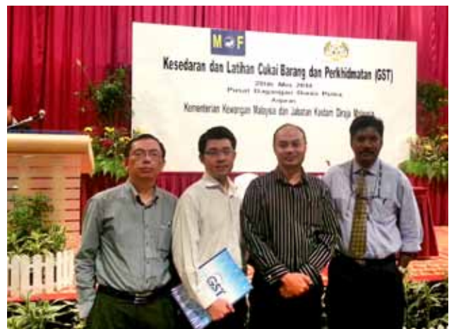
GST training and awareness programme on 28 May 2014 organised jointly by the Ministry of Finance Malaysia and Royal Malaysian Customs Department was one of the earlier training programme attended by KNM members.

KNM recognizes the need to understand the GST system, its impact on business operations and the preparations required to comply with the GST requirements. To date, numerous workshops and trainings have been organized to enable the staff to understand the GST subjects in detail.